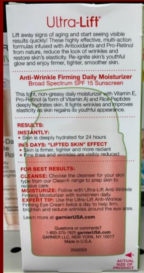
(Daily Moisturizer Front and Back)