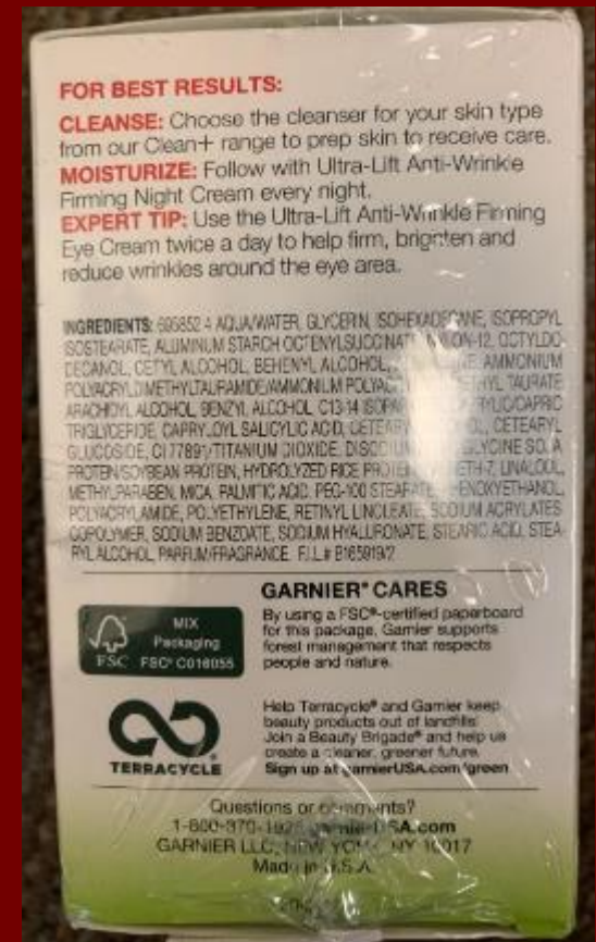
(Night Cream Front, Back, and Side)