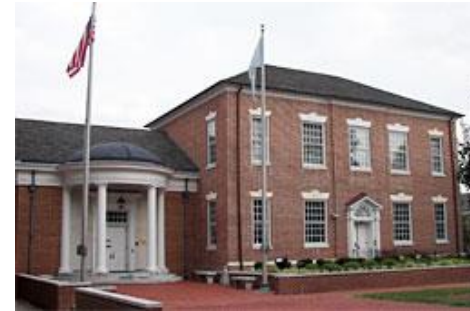
Delaware Supreme Court

7:15 a.m. Leave for Delaware Supreme Court, Dover, Delaware